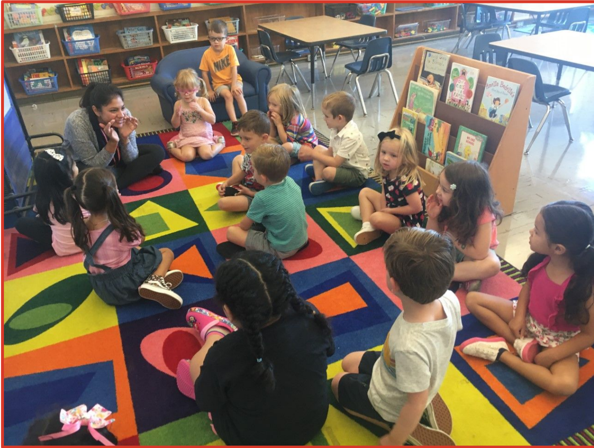
Pre-K Class during circle time