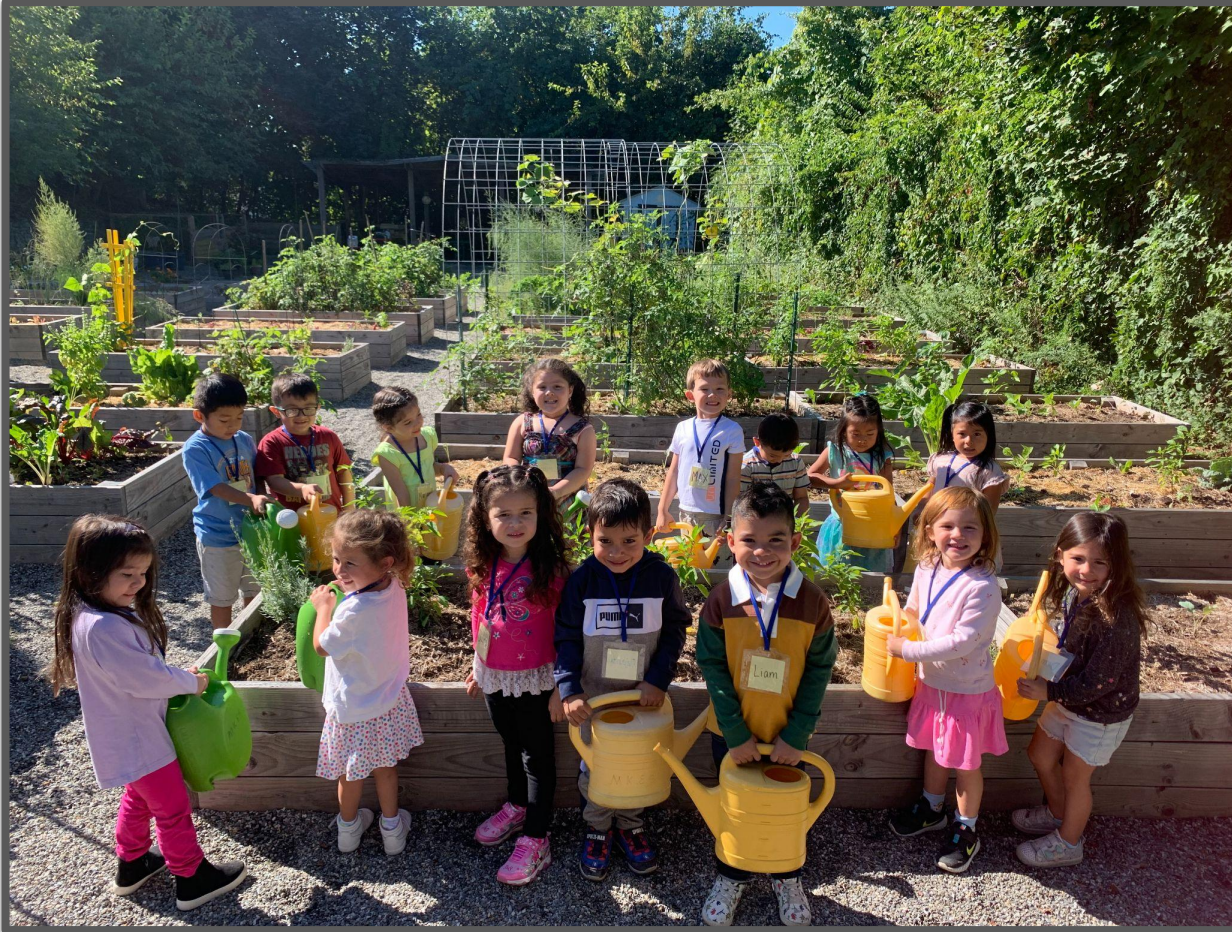
Pre-K Class in the garden